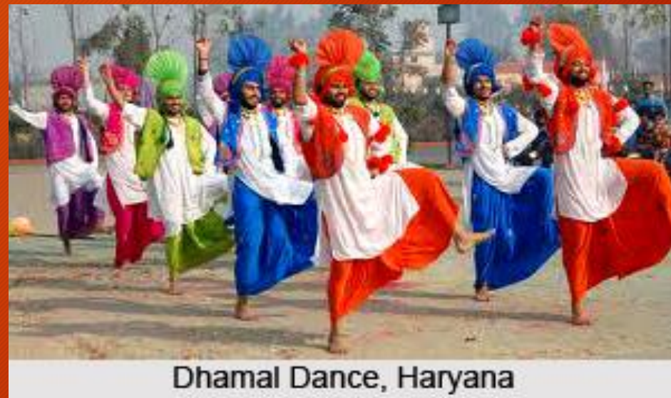
Dhamal Dance, Haryana

Dhamal Dance is performed to express love, joy, sorrow & hope. This dance style is so old that people believed that it was performed during the time of Mahabharata.